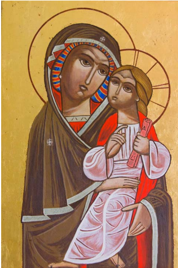
Icon painted in a Coptic (Egyptian) style

Congregation of Mark the Evangelist 1 January 2023 Christmas 1C Holy Name of Jesus