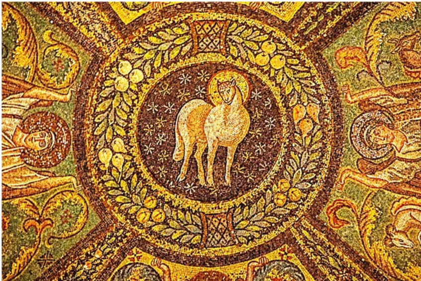
Lamb of God mosaic, San Vitale, Ravenna, Italy

Congregation of Mark the Evangelist 15 January 2023 Epiphany 2C