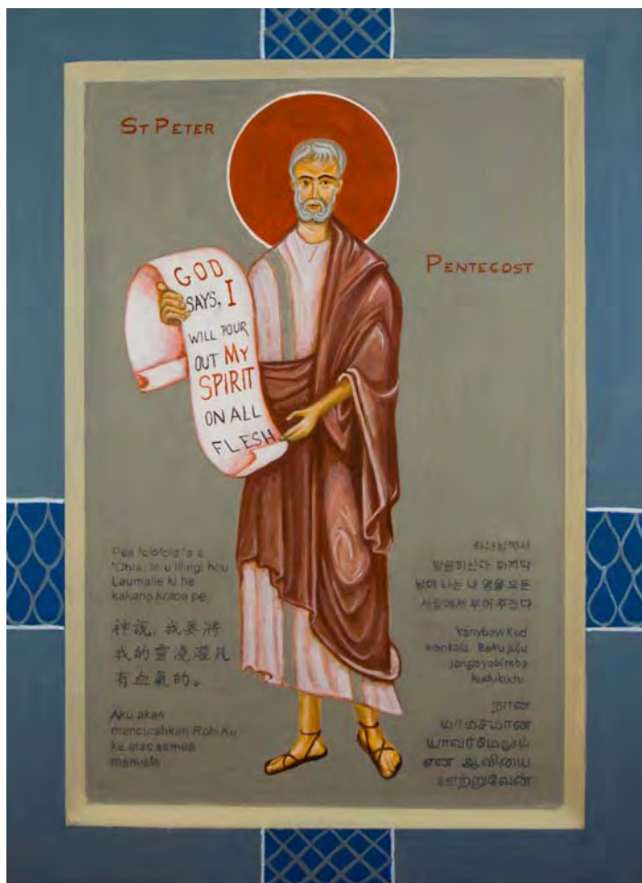
Congregation of Mark the Evangelist Pentecost B 19 May 2024