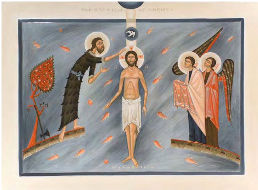
Icon painted by Olga Shalamova 2015