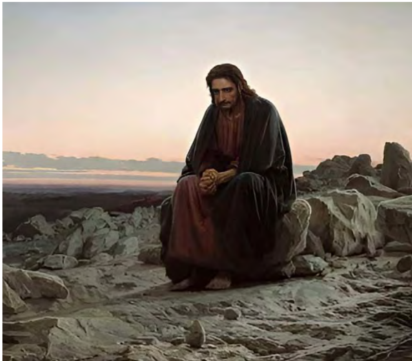
The temptation of Christ , Ivan Kramskoi (Russia, 1872) Tretyakov Gallery, Moscow

Welcome to this service of worship at Mark the Evangelist!