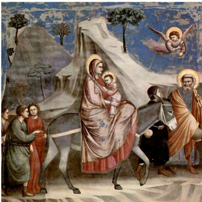
Giotto Bondone: Flight into Egypt (Scrovegni Chapel) c. 1304-1306

Welcome to this service of worship at Mark the Evangelist! Today's service is being live-streamed for the participation of those who can't join us physically today